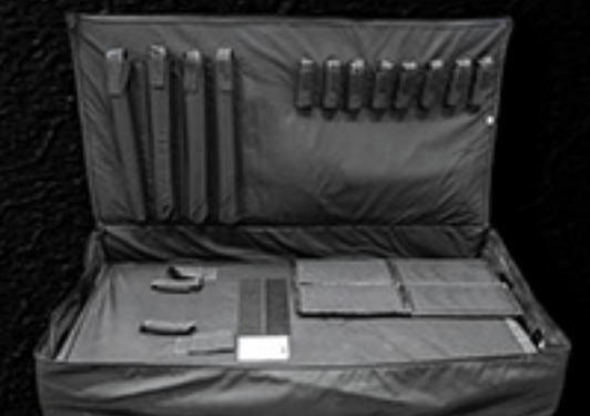
Soft carry case included with Flex Field 3

Solid armor barrier available in 2, 3 or 4 panel configurations