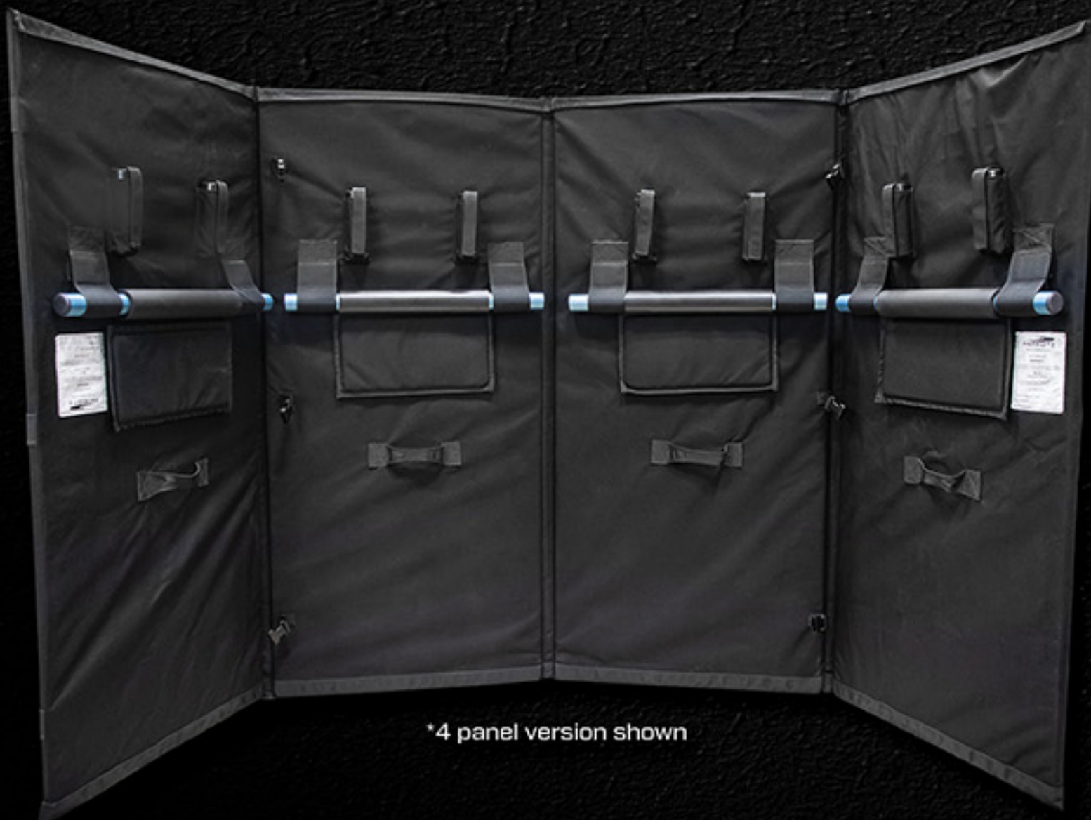
*4 panel version shown